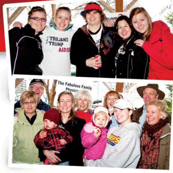
Some of the happy walkers